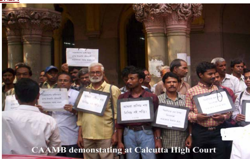
CAAMB demonstrating at Calcutta High Court

CAAMB protesting at Calcutta High court in support of Taslima Nasrin