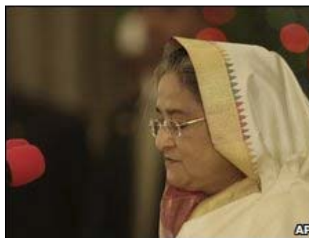
Sheikh Hasina's address to the nation was a turning point

The fact that the stand-off was resolved by Bangladesh's democratically elected government rather than the military - which for many years has been a dominant force in the country - is hugely important.